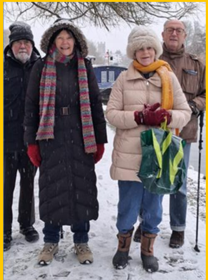
Some of our intrepid January morning walkers

SPACES AVAILABLE: The following groups currently have spaces available. Be quick as some of these are very limited: Board Games 2 , Board Games Evening , Creative Arts , Creative Writing , Effective Leaders , Family History , Film , Italian Beginners , Intermediate & Advanced , Jazz , Music Appreciation 1 & 2 , Poetry 1 and Singing for Joy . Activity and Social Groups are open to all members, as are Art Appreciation and Monthly Talks. Many other groups have waiting lists so please do add your name if you are interested.